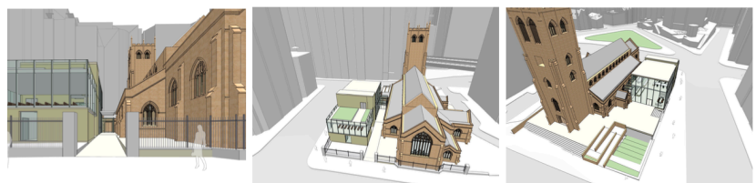
[This schematic is very much still early in concept, and will change as plans progress.]

Yes! The Parish Council welcomes your prayers. It is an exciting time, but there is much to do. We need to maintain our mission and vision to fill the city with the Gospel, ahead of God filling the whole earth with the knowledge of his Glory.